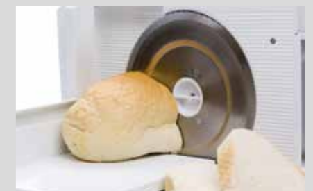
PRODUCT NAME Bistro Manu 940 Dishwashing agent IPA Sprit 70%