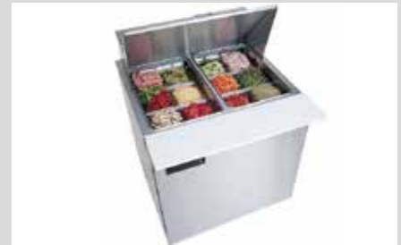
PRODUCT NAME Bistro Manu 940 Dishwashing agent Desinfect O