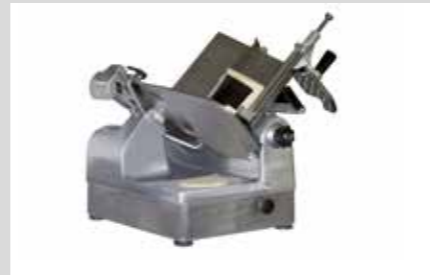
PRODUCT NAME Bistro Manu 940 Imo Alka 910 Desinfect O IPA Sprit Wipes