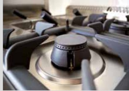
PRODUCT NAME Bistro Manu 940 Imo Alka 910 Desinfect O