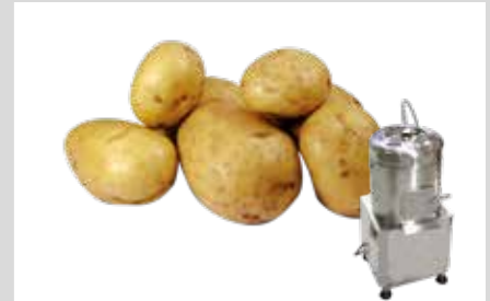
PRODUCT NAME Bistro Manu 940 Dishwashing agent Desinfect O