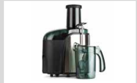
PRODUCT NAME Bistro Manu 940 Dishwashing agent Desinfect O