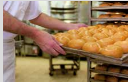
PRODUCT NAME MANUAL CLEANING