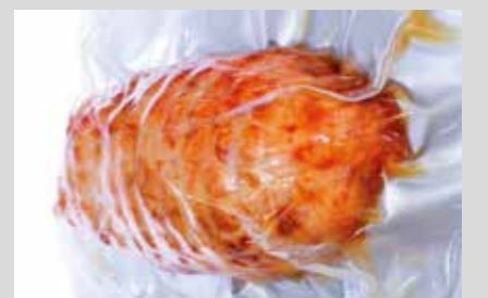
PRODUCT NAME Imo Alka 910 Foam Alka 334 Dishwashing agent