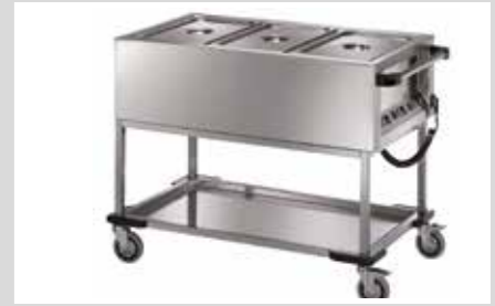
PRODUCT NAME Bistro Manu 940 Dishwashing agent Imo Alka 910 Desinfect O