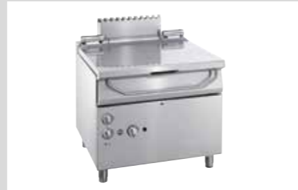
PRODUCT NAME Imo Alka 910 Desinfect O