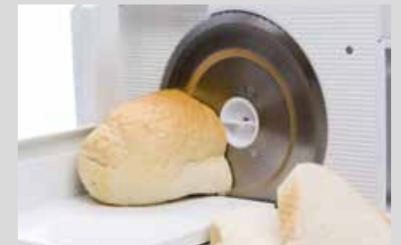
PRODUCT NAME Bistro Manu 940 Dishwashing agent IPA Sprit 70%