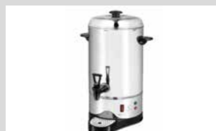
PRODUCT NAME Bistro Manu 940 Imo Alka 910 Lime 374