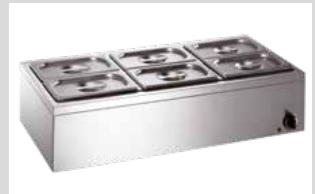
PRODUCT NAME Bistro Manu 940 Desinfect O