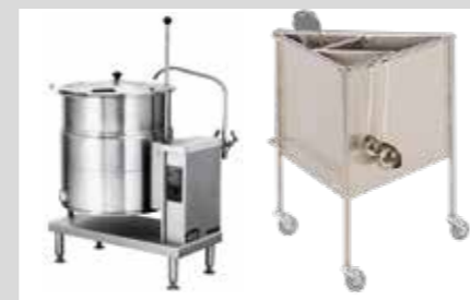
PRODUCT NAME KIPGRYDE: Bistro Manu 940 Imo Alka 910