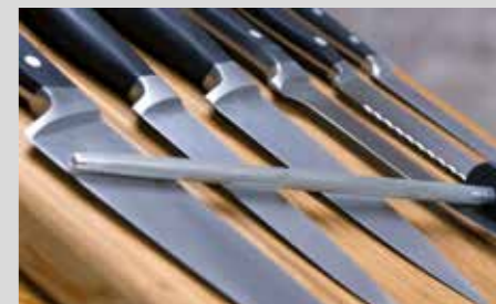
PRODUCT NAME Bistro Manu 940 Dishwashing agent Desinfect O

Tools: (Icing bags, e.g. cake fillings and cream fillings). Remember to hang on a drying rack