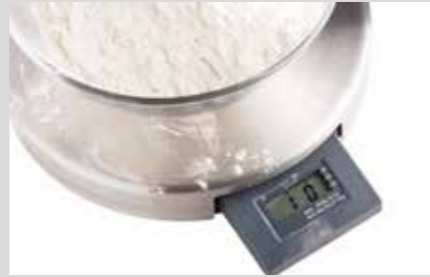
PRODUCT NAME Bistro Manu 940 Desinfect O